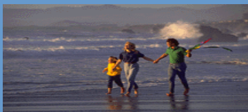
Active Healthy Islanders