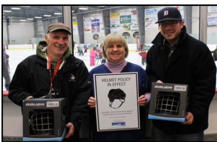
Cavendish Farms Wellness Centre, Monta-

Recreation PEI has aided 17 of the 25 arenas on PEI in adopting a Helmet Safety Policy. Each arena has received a personalized Helmet Safety Policy booklet along with material on the buzz topic: “ CONCUSSIONS ”.