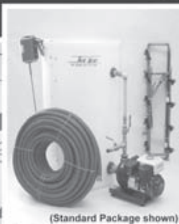
(Standard Package shown)

Our application packages are exclusively designed for fast and easy application of our white ice paint.