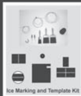
Ice Marking and Template Kit

Our application packages are exclusively designed for fast and easy application of our white ice paint.